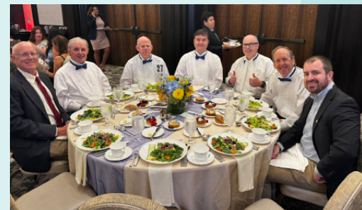
Citizens and Community Members enjoyed the delicious lunch at the Post Oak Hotel at Uptown Houston