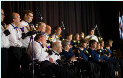
The Brookwood Handbell Ensemble played several songs, including favorite Lean on Me